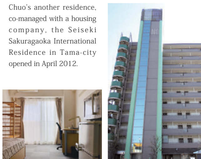
Chuo's another residence, co-managed with a housing company, the Seiseki Sakuragaoka International Residence in Tama-city opened in April 2012.