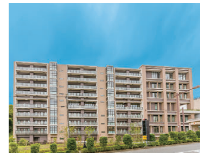
International Residence Chuo (IRC)